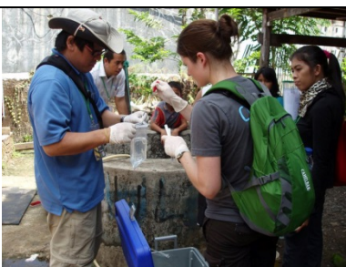
Project: Water, sanitation, and childhood diarrhea