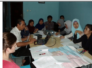
Discussing local and global health issues