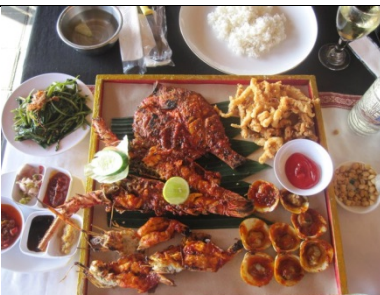
This could be so expensive in the US, but not here ☺