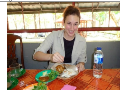
Cheap, healthy, and yummy lunch on UNHAS campus