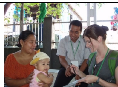
Project: Mother and childhood diarrhea