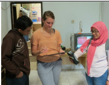
Project: Indoor air quality and childhood pneumonia