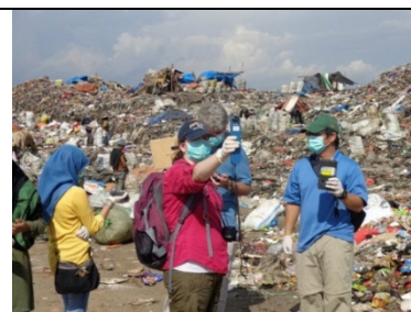
Project: Waste pickers & children in a landfill