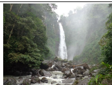
Exploring beautiful nature