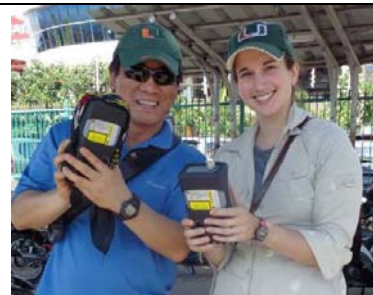
Project: Traffic-related air pollution exposures