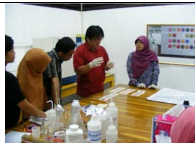
Obtaining practical skills