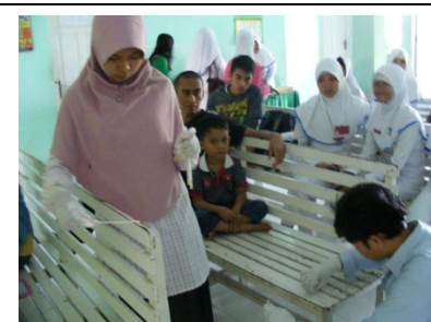
Project: Healthcare associate infections