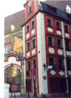
Two tiny 16th century Baroque houses called 'Jas and Malgosia' in Polish mark the gateway to the Church of St. Elizabeth in Wroclaw.

Wroclaw , is the economical, cultural and intellectual capital of southwestern Poland's province of Lower Silesia. It is located on the Oder River 160 km from Germany and 120 km from the Czech Republic. As Poland's fourth largest city, Wroclaw is a center of industry, communications, transport, education, and the arts. Situated at the foot of the Sudety Mountains, upon the Oder River, Wroclaw is an exceptional city of 12 islands and 112 bridges. Wroclaw's complex and dramatic history is embedded in the city walls. Monuments such as the early medieval complex of buildings of Ostrów Tumski Island are some of the most beautiful examples of sacral architecture in Europe. Wroclaw Town hall is considered one of the most splendid Gothic buildings in central Europe. Eight educational institutions are located in the city along with nine museums, several theaters and music centers, and a botanical garden and zoo. Wroclaw originated in the 10th century AD at the crossroads of trade routes. It was first governed by the Polish Piast kings and in the following centuries was ruled at various times by the Germans, Bohemians, and Prussians.