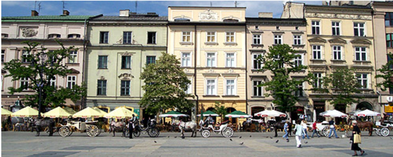
Numerous sidewalk cafes line Rynek Główny (Main Square) as well as other streets and squares of Krakow's central Old Town historical district.

Although the city no longer plays such an important administrative role, due to its rich history Krakow represents a synthesis of all things Polish, connecting tradition with modernity. In the special atmosphere of the beautiful and mysterious streets of the Old Town and Kazimierz you will find everything you need to allow you to escape from everyday life. Galleries full of exhibitions, cafes, pubs and restaurants are an integral part of any visit to Krakow.