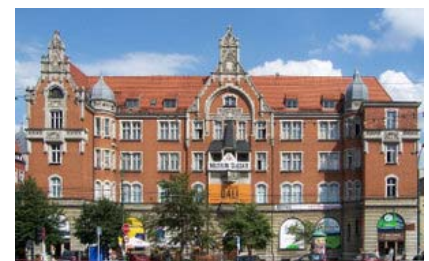
Katowice, Silesian Museum

The Academy of Fine Arts in Katowice will serve as the host for this NIU program. The Academy, a branch of the famous Academy of Fine Arts in Krakow for over 50 years, has been an independent university since 2001. The Academy is divided into three departments: graphic arts (printmaking and graphic design), design (visual communication design and functional structure design), and painting. The Academy used to specialize in printmaking, graphic design and industrial design. Katowice has always been a center of graphic artists, with a Polish Print Triennial and Polish Poster Biennial. At present, it combines traditional workshops such as lithography, woodcut, etching, with new media, animation, and digital video.