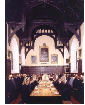
Oriel College dining hall

Students will reside in rooms in or near Oriel College. Breakfast will be served daily and dinner will be served each Sunday through Wednesday in the 17th-century Hall. Students will be responsible for the purchase of all lunches, as well as dinners on Thursday, Friday and Saturday. Students can arrange access to the College Library and other Oxford libraries. The College has kitchens, laundry rooms, and dry cleaning and other services such as grocery stores and restaurants are available nearby.