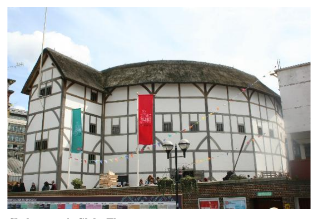
Shakespeare's Globe Theatre