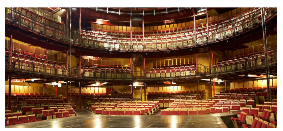
Royal Shakespeare Company Stratford-upon-Avon

Note: Advanced graduate-level enrollment involving targeted scholarly research in consultation with the professor.