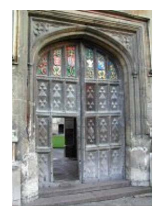
Entrance to Porter's Lodge

The program will take place in Oriel College, founded in 1326 and considered to be one of the most beautiful of the 34 colleges that make-up Oxford University. Oxford is less than 60 miles from London and Stratford-upon-Avon, with frequent and inexpensive bus service to both cities. Cambridge, Canterbury, and other places with literary and historical connections are within 100 miles, and there is virtually no place in Britain or, indeed, Europe that cannot be visited on a weekend trip.