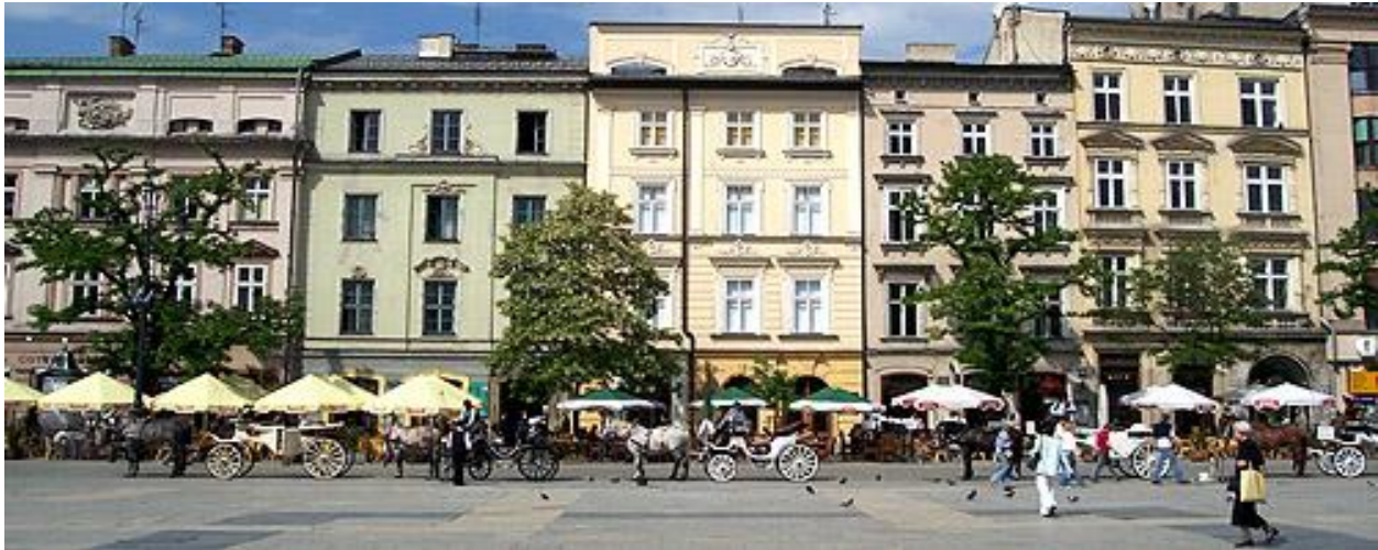
Numerous sidewalk cafes line Rynek Główny (Main Square) as well as other streets and squares of Krakow's central Old Town historical district.

Although the city no longer plays such an important administrative role, due to its rich history Krakow represents a synthesis of all things Polish, connecting tradition with modernity. In the special atmosphere of the beautiful and mysterious streets of the Old Town and Kazimierz you will find everything you need to allow you to escape from everyday life. Galleries full of exhibitions, cafes, pubs and restaurants are an integral part of any visit to Krakow.