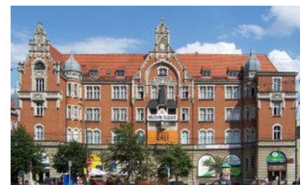
Katowice, Silesian Museum

The Academy of Fine Arts in Katowice will serve as the host for this NIU program. The Academy, a branch of the famous Academy of Fine Arts in Krakow for over 50 years, has been an independent university since 2001. The Academy is divided into three departments: graphic arts (printmaking and graphic design), design (visual communication design and functional structure design), and painting. The Academy used to specialize in printmaking, graphic design and industrial design. At present, it combines traditional techniques such as lithography, woodcut, etching, with new media, animation, and digital video. Katowice has always been a center of graphic artists, with a Polish Print Triennial and Polish Poster Biennial.