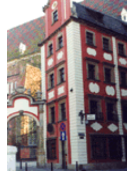
Two tiny 16th century Baroque houses called 'Jas and Malgosia' in Polish mark the gateway to the Church of St. Elizabeth in Wroclaw.

Wroclaw , is the economical, cultural and intellectual capital of southwestern Poland's province of Lower Silesia. It is located on the Oder River 160 km from Germany and 120 km from the Czech Republic. As Poland's fourth largest city, Wroclaw is a center of industry, communications, transport, education, and the arts. Situated at the foot of the Sudety Mountains, upon the Oder River, Wroclaw is an exceptional city of 12 islands and 112 bridges. Wroclaw's complex and dramatic history is embedded in the city walls. Monuments such as the early medieval complex of buildings of Ostrów Tumski Island are some of the most beautiful examples of sacral architecture in Europe. Wroclaw Town hall is considered one of the most splendid Gothic buildings in central Europe. Eight educational institutions are located in the city along with nine museums, several theaters and music centers, and a botanical garden and zoo. Wroclaw originated in the 10th century AD at the crossroads of trade routes. It was first governed by the Polish Piast kings and in the following centuries was ruled at various times by the Germans, Bohemians, and Prussians.