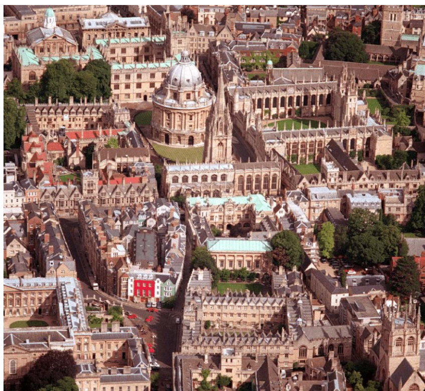
Aerial view of Oriental College, Oxford

This will be the 44th annual summer program offered by Northern Illinois University and Oriental College featuring courses on the undergraduate and graduate levels that are designed to take advantage of the unique resources of the British setting, including the Oxford libraries, theaters of London and Stratford-upon-Avon, and selected cultural, historical and scientific field trip sites. Faculty are accommodated close to students and dine in the same halls so that formal class meetings can be supplemented by individual tutorials and informal conversations. Enrollment in all courses is deliberately kept low in order to permit maximum interaction between students and faculty.