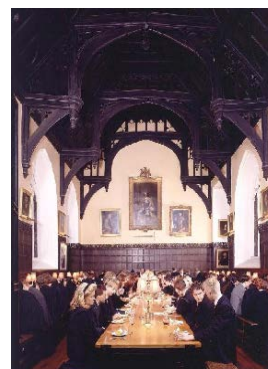
Oriel College dining hall

The program cost includes one trip to Stratford-upon-Avon with tickets to a Royal Shakespeare Company performance, and other trips to sites of academic interest, to be announced. Optional trips, at the students' expense, will also be offered, and students will be encouraged to travel on their own.