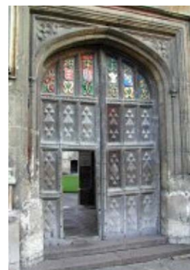
Entrance to Porter's Lodge

The program will take place in Oriental College, founded in 1326 and considered to be one of the most beautiful of the 34 colleges that make-up Oxford University. Oxford is less than 60 miles from London and Stratford-upon-Avon, with frequent and inexpensive bus service to both cities. Cambridge, Canterbury, and other places with literary and historical connections are within 100 miles, and there is virtually no place in Britain or, indeed, Europe that cannot be visited on a weekend trip.