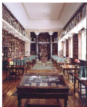
Oriel College Library