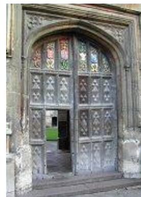
Entrance to Porter's Lodge

The program will take place in Oriel College, founded in 1326 and considered to be one of the most beautiful of the 34 colleges that make-up Oxford University. Oxford is less than 60 miles from London and Stratford-upon-Avon, with frequent and inexpensive bus service to both cities. Cambridge, Canterbury, and other places with literary and historical connections are within 100 miles, and there is virtually no place in Britain or, indeed, Europe that cannot be visited on a weekend trip.