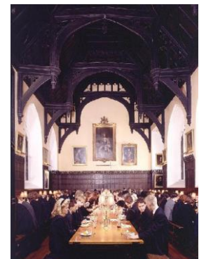
Oriel College dining hall

Students will reside in modern single rooms in Oriel College's James Mellon Hall. Breakfast will be served daily and dinner will be served each Sunday through Wednesday in the 17th-century Hall. Students will be responsible for the purchase of all lunches, as well as dinners on Thursday, Friday and Saturday. Students will have access to the College Library and other Oxford libraries. The college has a laundry room, and dry cleaning is available nearby.