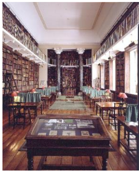
Oriel College Library