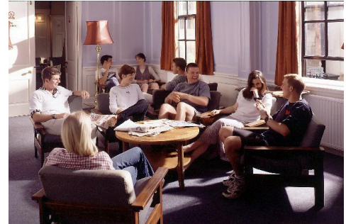
Common Room - Oriel College

Although this is an academic program, it has been designed with a variety of audiences in mind. Non-traditional students (i.e., professionals, individuals with an interest in this subject matter, etc.) as well as currently enrolled students are encouraged to participate in this program. All participants will receive academic credit, and students who are not currently enrolled in an academic program at NIU will be enrolled as visiting students (at the undergraduate level) or Students-at-Large (at the graduate level).